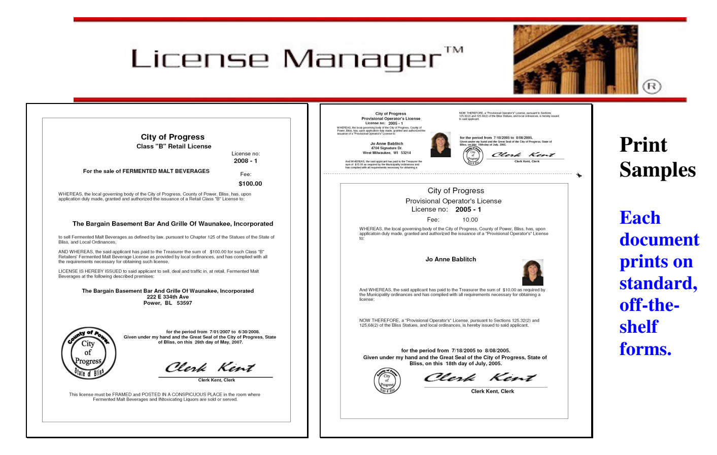
Class B Retail Beer License

Operator's Provisional Wallet with Sheet License. Both on plain paper.